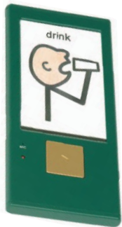
Fig. 1. GoTalk Pocket:

While, the main focus of the Communication Devices Program is on high tech communication devices, we also offer some very basic systems that may meet the needs of your clients. We have a large array of basic static display devices such as the; Big or Small Step-by-Step (with and without levels), iTalk2, GoTalk Pocket & more. Some of the features of these devices are described below. For further, more detailed information about each device, click the picture to be linked to the manufacturer's website.