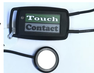
Fig. 6: Touch Contact

Finally, we have one Touch Contact Switch . This switch does not require any force for activation, just contact, on the small silver disc. This switch is very small, and can be positioned anywhere. One of the other major differences with this switch is that it doesn't offer any feedback (tactile, auditory, visual, etc), while the other switches offer minimal tactile feedback, as well as potentially some auditory feedback.