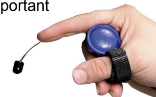
Fig. 5: Finger Switch

then only needs a small movement to activate it, or for those with small involuntary movements that would otherwise activate a switch, but because of the length of the lever arm small involuntary movements may not be seen as activations.