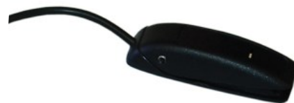
Fig. 1: Ultralight Switch

For some of our clients with the most significant physical involvement, we need to have access to VERY sensitive switches. CDP has a variety of light force/sensitive switches that we/you can try with clients.