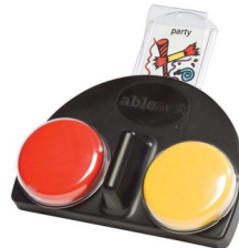
Fig. 2. iTalk2 (with levels):