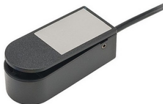
Fig. 2: Microlight

Some of the most common switches include the Ultralight and Microlight switches . They both require very light pressure to activate, are small, and can easily be positioned wherever they are needed. The main difference between the two is the overall profile. The microlight is slightly higher than the ultralight, meaning that the client may have to move their finger (or whichever body part they are using) through a greater range, to activate the switch.