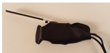
Fig. 4: MicroSwitch

Two more of our incredibly light force switches are the MicroSwitch and the Finger Switch . These switches have one very important difference from the above 3, they have a much longer travel distance before the switch will activate. This may be helpful for a client that rests on the switch and