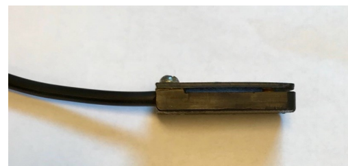
Fig. 3: “Brad’s Switch”

Another light pressure switch is the Light Touch or “Brad’s Switch” . These switches were custom made for CDP by Brad Masiowski at Assistive Technology Products and Services prior to his retirement. These switches are very low profile and require just slightly more force than the ultralight or microlight. This may be good for those client who need a light touch switch, but the above 2 activate too easily for them, OR the overall height/profile is too large.