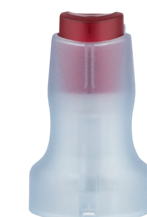
Cannula insertion device

Note: The Instructions for Use for the cannula will be provided by your health care professional. If you are unsure about any instructions or if you have misplaced these instructions, ask your health care professional.